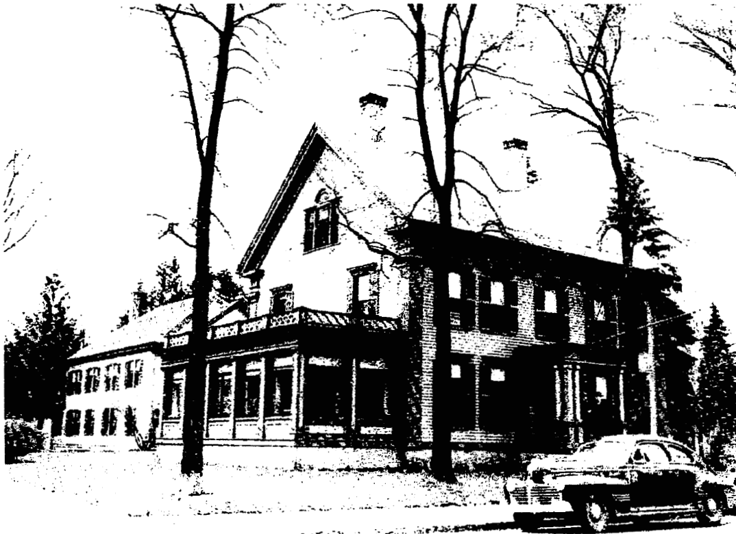
State Headquarters, 146 State Street, Augusta, ca. 1946.

All Granges; Officers; State Sessions; National Sessions; National Officers; History Notes April 21, 1874 MSG HQ -- June 29, 2024 1:00 – 4:00 pm Short program at 2:30